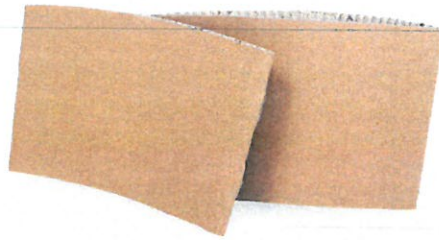
Coffee Cup Sleeves, Fluted [Code: CSMB, CSULB-PK] Size: Medium, Large