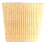
Ripple Wall [Code: RW10s-PK2] Size: 10oz Squat