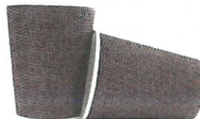
Mayfair Ripple Wall Cup [Code: RW12-Mayfair] Size: 12oz, 16oz