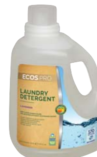
ECOS® Lavender 170 oz