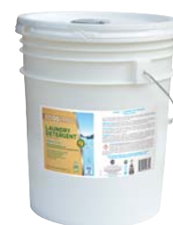
ECOS® Free & Clear 5 gallon pail