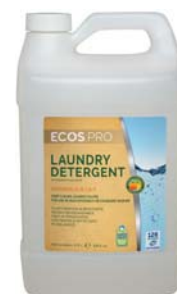
ECOS® Magnolia & Lily One gallon