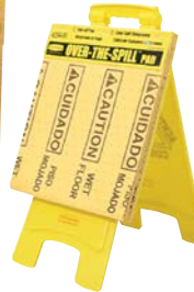
FG425400 on FG611200