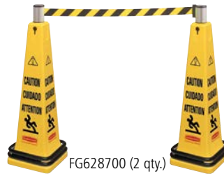
FG628700 (2 qty.)