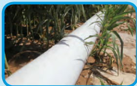
We make the irrigation polytube

Revolution Bag creates liners through a closed-loop, in-house system that ensures the highest-quality post-consumer recycled resin (PCR)