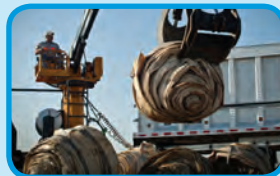
We pick up the used polytube from farmers