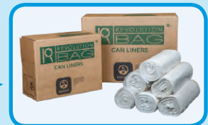
We make Revolution Bag can liners for you