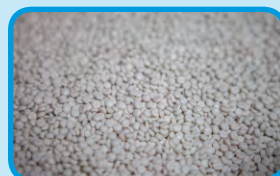
We recycle the polytube into certified 100% PCR