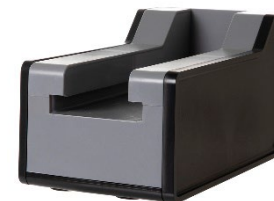
Single Dispenser Base EPCEBASESINGLE