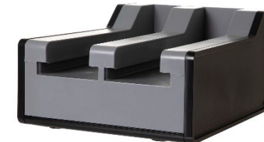
Double Dispenser Base EPCEBASEDOUBLE