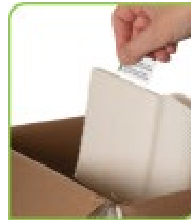
Cutlery Loading Tabs

*Compostable in commercial facilities only, which may not exist in your area.