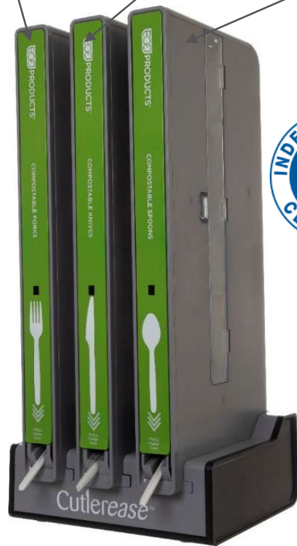
Triple Dispenser Base EPCEBASE