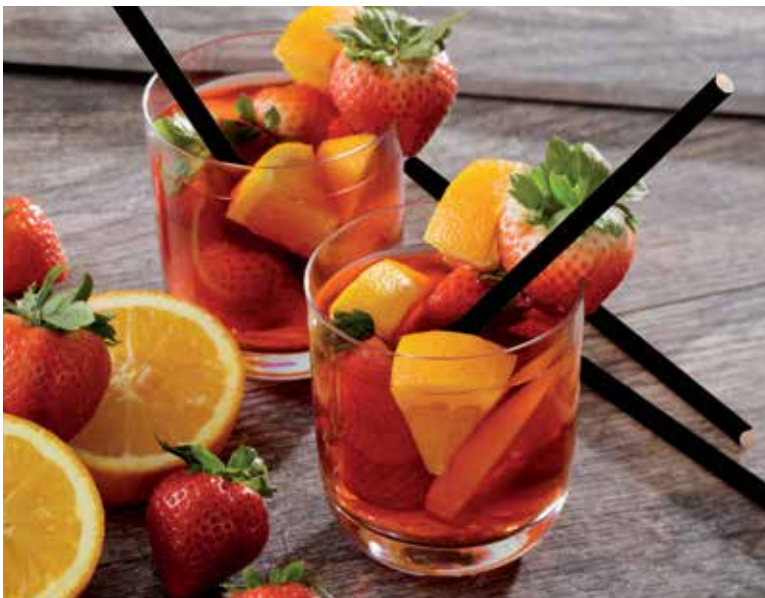
5.5" Black Cocktail Straw