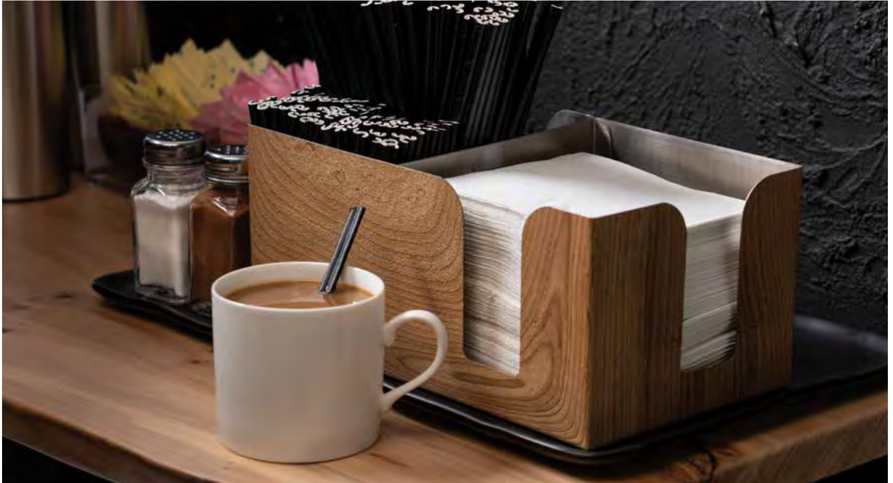
5" Black Coffee Stir

Great for hot or cold beverages. Great for mixing drinks such as coffee, tea, mixed drinks, cocktails, hot chocolate, etc. Perfect for restaurants, bar supply, coffee shops, concession stands, schools or office break rooms