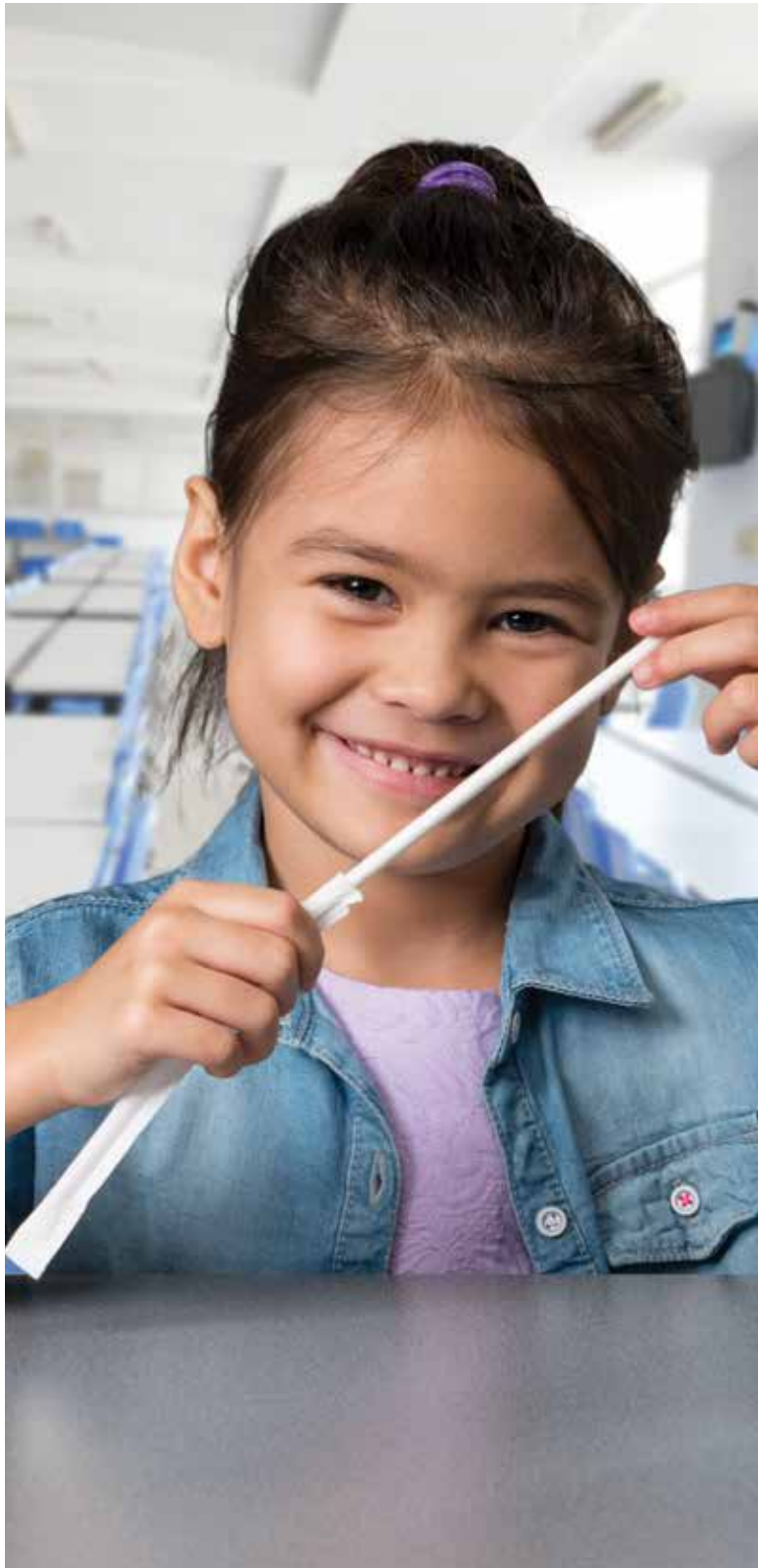
5.75" White Milk Straw