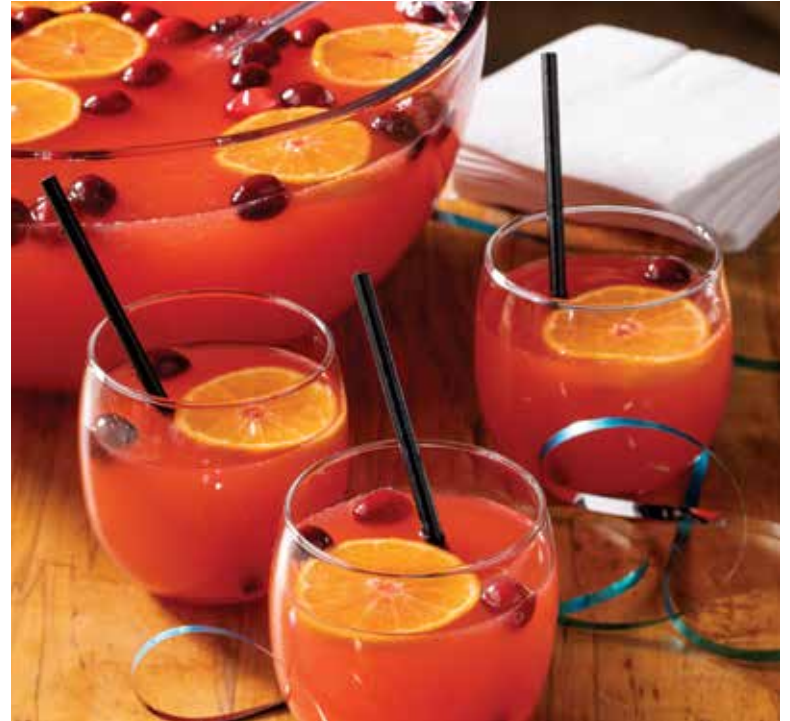
5.75" Black Bar Stir