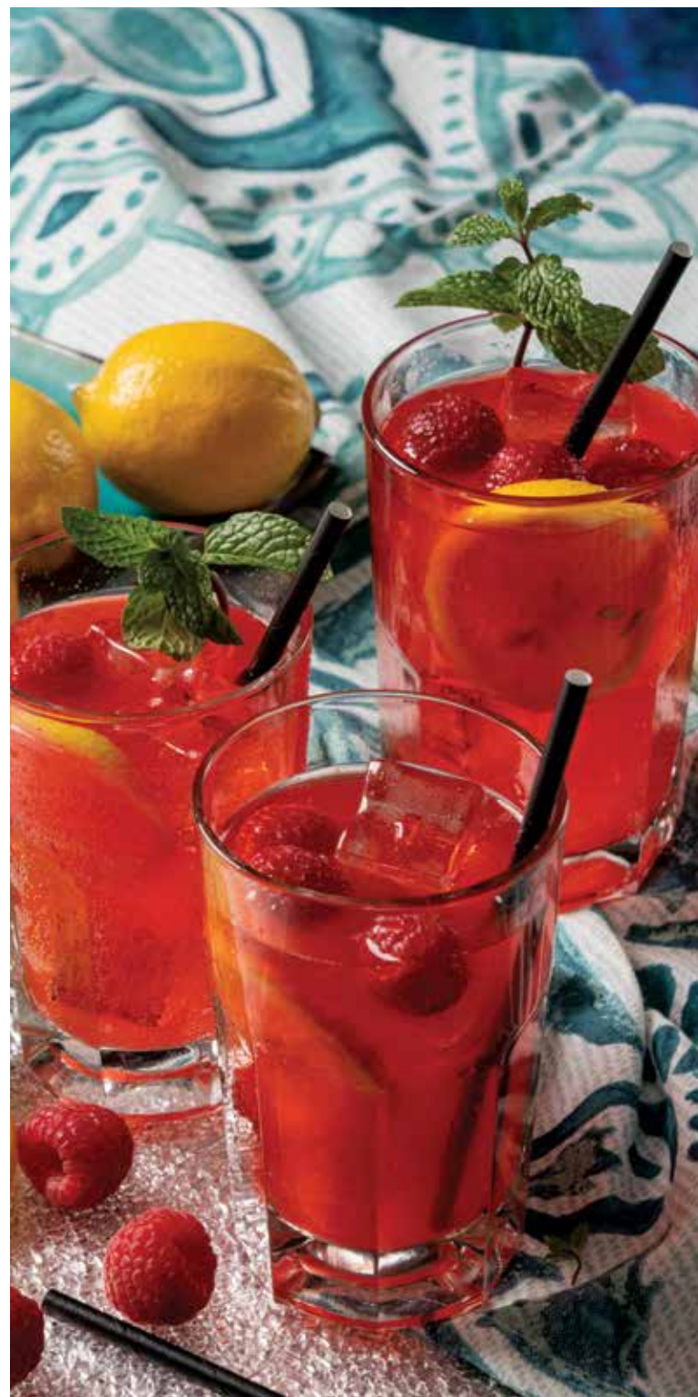
7.75" Black Drinking Straw