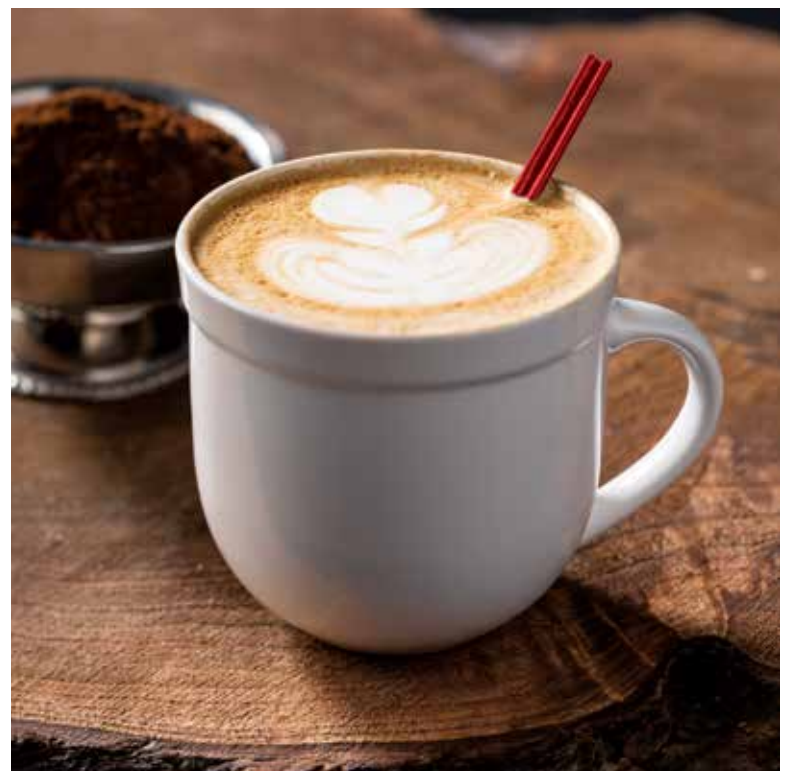
5" Red Coffee Stir