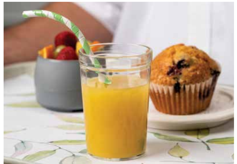
7.75" Striped Green Flex Straw