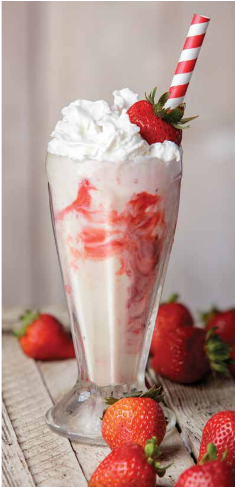
8.5" Striped Red/White Milkshake Straw