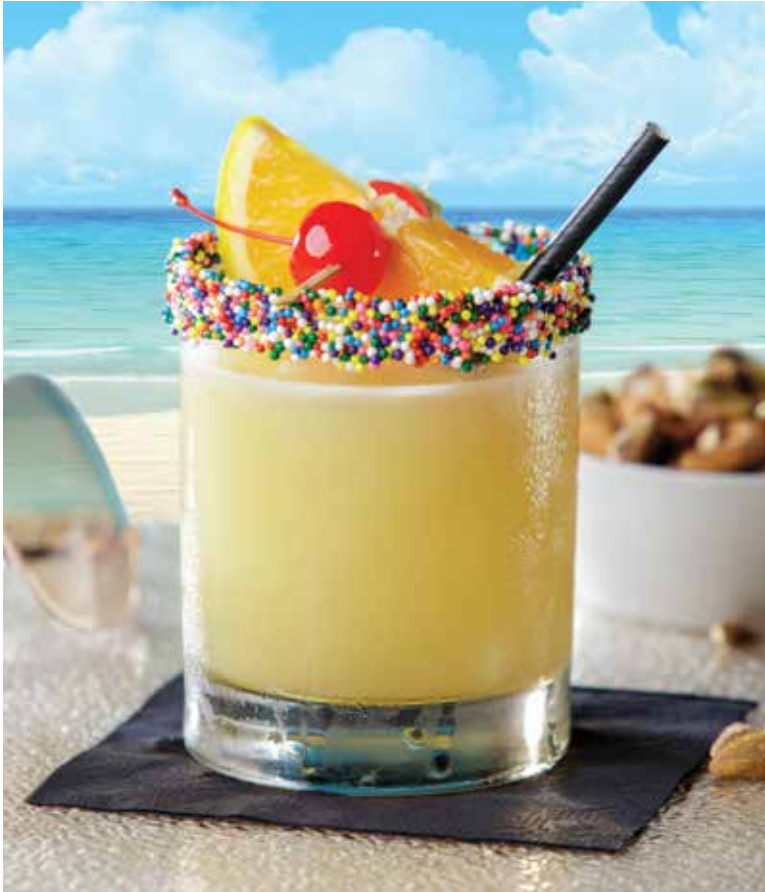
5.5" Black Cocktail Straw