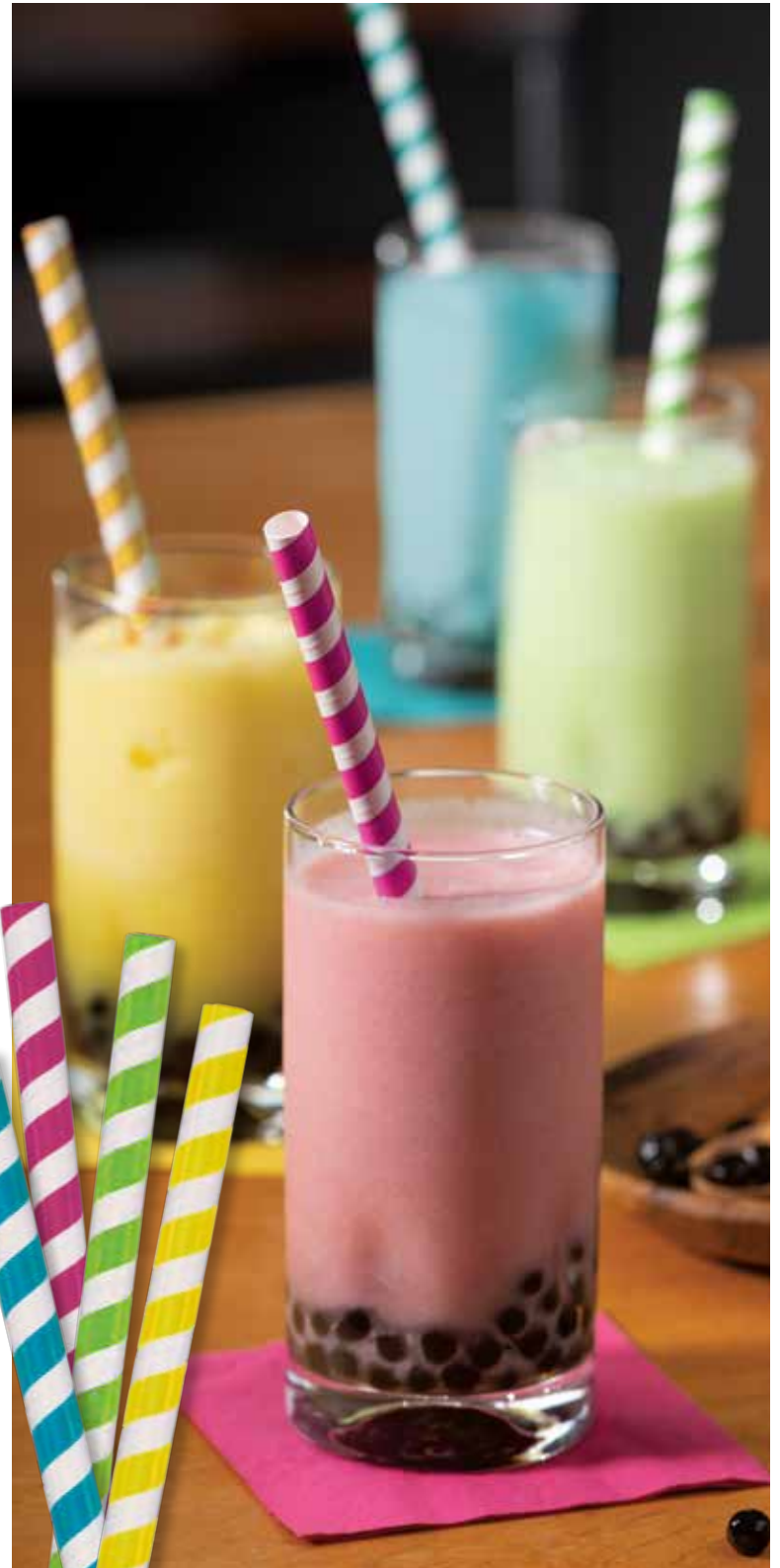
8.5" Striped Boba Tea Straws - Assorted