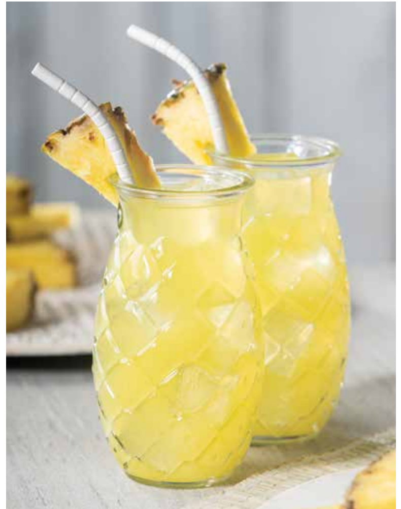
7.75" White Flex Straw