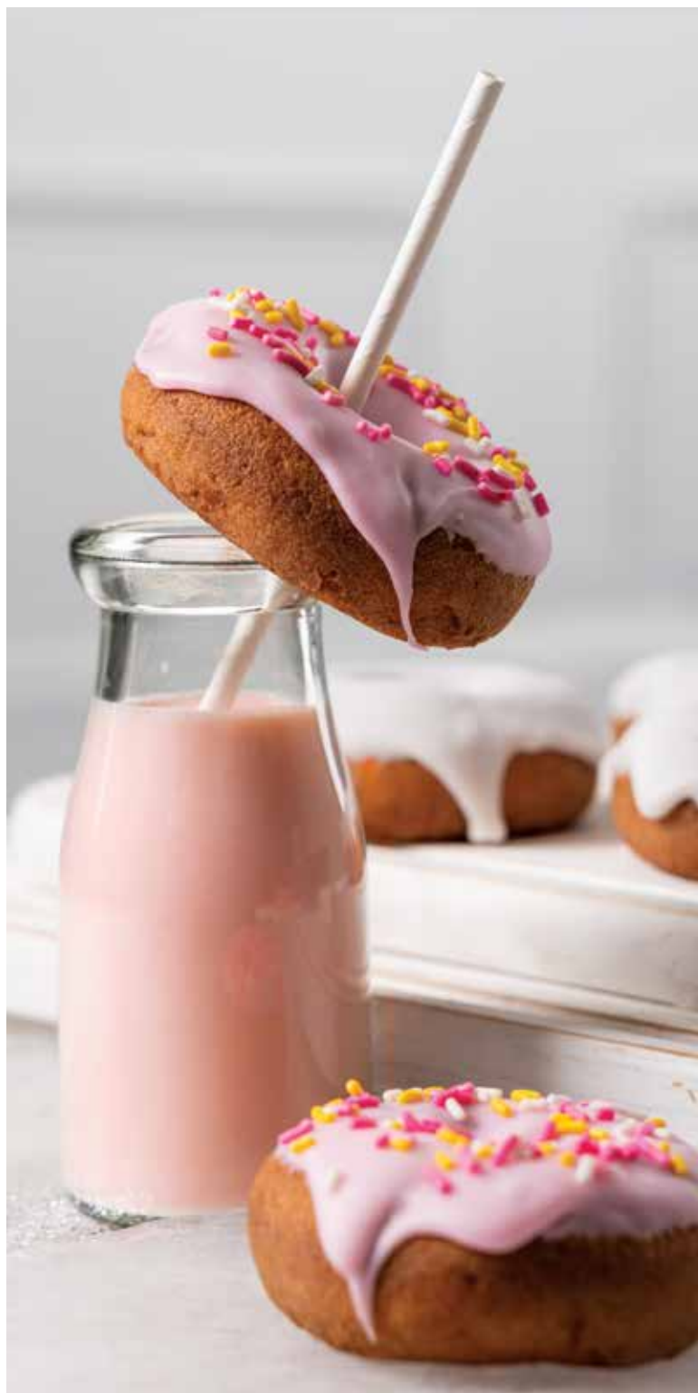
10" White Drinking Straw