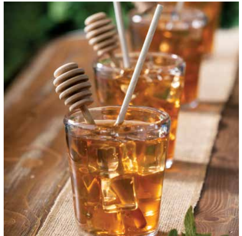
7.75" White Bar Stir