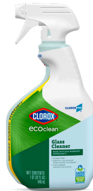
9/32 oz. Spray, Case UPC: 60277