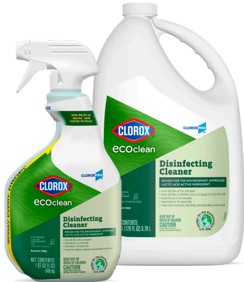
9/32 oz. Spray, Case UPC: 60213 4/128 oz. Refill, Case UPC: 60094

More sustainable cleaners and disinfectants that help keep facilities clean and healthy while using EPA Safer Choice and Design for Environment approved ingredients.