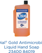
Dial® Gold Antimicrobial Liquid Hand Soap 23400 84019