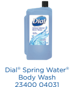
Dial® Spring Water® Body Wash 23400 04031

1 Liter Dial® Manual Liquid Dispenser (Smoke dispenser) 23400 03922 (Ice dispenser) 23400 03920