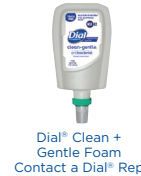
Dial® Clean + Gentle Foam Contact a Dial® Rep