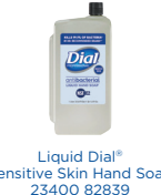
Liquid Dial® Sensitive Skin Hand Soap 23400 82839