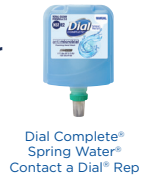
Dial Complete® Spring Water® Contact a Dial® Rep

1.7 or 1.2 Liter Dial® 1700 Manual Dispenser Available in Smoke and Pearl