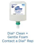
Dial® Clean + Gentle Foam Contact a Dial® Rep