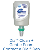
Dial® Clean + Gentle Foam Contact a Dial® Rep