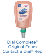
Dial Complete® Original Foam Contact a Dial® Rep