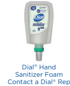
Dial® Hand Sanitizer Foam Contact a Dial® Rep