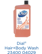
Dial® Hair+Body Wash 23400 04029