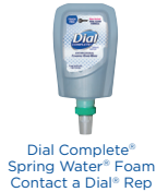
Dial Complete® Spring Water® Foam Contact a Dial® Rep

1 Liter Dial® FIT® Touch-Free Dispenser Available in Slate and Ivory