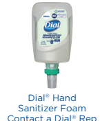
Dial® Hand Sanitizer Foam Contact a Dial® Rep