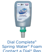
Dial Complete® Spring Water® Contact a Dial® Rep

1.2 Liter Dial® FIT® Manual Dispenser Available in Slate and Ivory