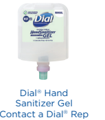
Dial® Hand Sanitizer Gel Contact a Dial® Rep