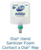
Dial® Hand Sanitizer Foam Contact a Dial® Rep