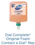
Dial Complete® Original Foam Contact a Dial® Rep