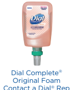
Dial Complete® Original Foam Contact a Dial® Rep