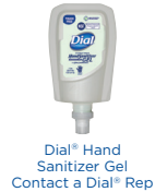
Dial® Hand Sanitizer Gel Contact a Dial® Rep