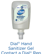
Dial® Hand Sanitizer Gel Contact a Dial® Rep