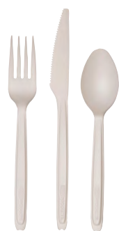
EP-CE6FKWHT EP-CE6KNWHT EP-CE6SPWHT