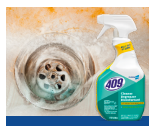
Dissolves Grease, Grime, Tough Messes On Contact

To help maintain a healthy facility, use products in your cleaning routine that are specifically formulated to tackle these soils quickly and easily, so you can do more while you clean. Prevention is the best protection.