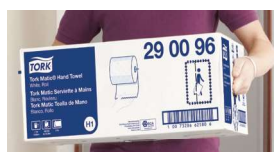
Use two hands for a comfortable grip