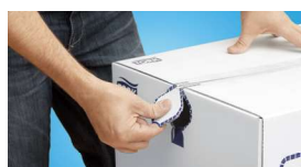
Boxes open quickly and easily without cutting