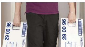
Carry a box with each hand and save time