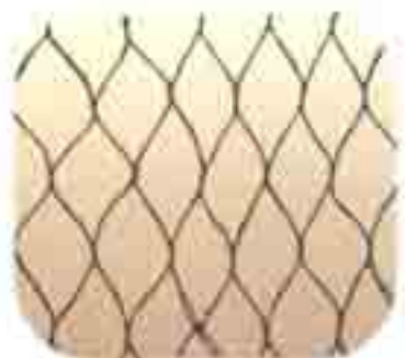
HN-400 & 500