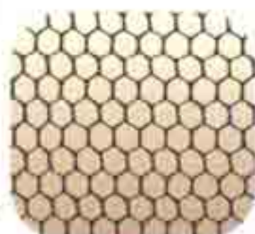
K-100 & 200