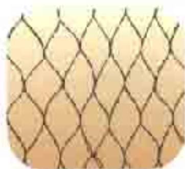
HN-400 & 500