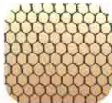
K-100 & 200